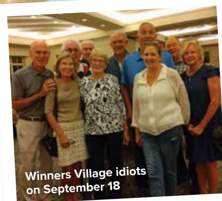
Winners Village idiots on September 18

If you plan on decorating your golf cart or car, please email ckulp@thegeorgiaclub.com so we can reserve a spot for your cart!