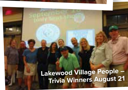
Lakewood Village People – Trivia Winners August 21