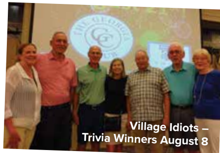
Village Idiots – Trivia Winners August 8