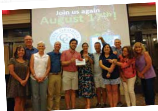
++Plus tax & gratuity.

Get together your best team and test your knowledge! Subjects include TV,